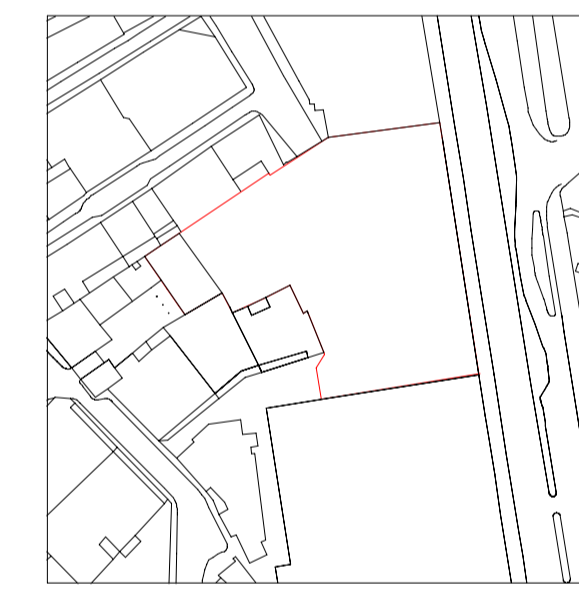
Key Plan: 1:1500

CLIENT Arindel Properties Ltd PROJECT 150 Aldersgate Street & 3-4 Bartholomew Place