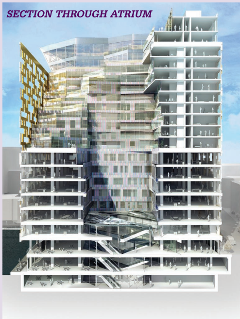
SECTION THROUGH ATRIUM

Starting two floors above street level, a glass-clad open-roofed atrium rises and twists through the centre of the building, opening out towards the north-west elevation to allow daylight into flats on the upper floors through a fretwork screen.